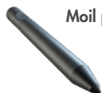
Moil point tool