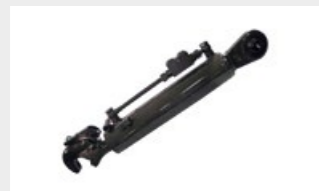
Hydraulic top link