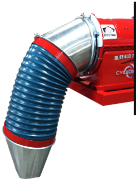
Flexible Nozzle Assembly - Part# 3345 Various lengths available. Ideal for rough terrain.