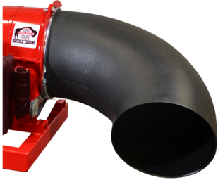
Aerospace Polymer Nozzle - Part# 2851 Standard Clamp Band - Part# 1173