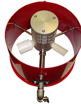
Gyratory Atomizing Nozzle - Part# 2547 (Safety guard removed for clarity)